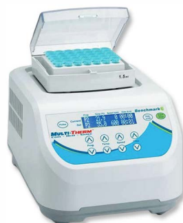
MultiTherm™ Thermal Shaker

Temp. Range: Ambient +5 to 70°C Shaking Orbit: 2mm Shaking Speed: 100-1,500 rpm