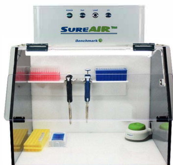
SureAir™ PCR Workstation