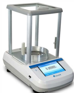
Accuris™ TX Balance, 220g

Kickstart the Semester with Lab Favorites for $2,025