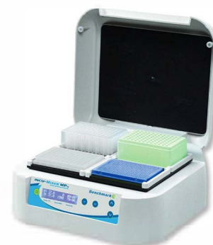
Incu-mixer™ MP Heated Microplate Vortexer, 4 position Mixer

Speed Range: 200 to 13,500 rpm (up to 16,800xg) Capacity: 24 x 1.5/2.0ml 2 x PCR Strips (16 x 0.2ml)