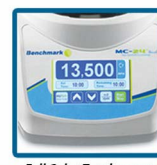
Full Color Touchscreen