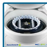
Unique Combi-Rotor Accepts tubes and strips