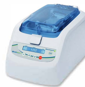
BeadBug™ 6 Six Position Homogenizer

Light Source: 8W UV-C Bulb Int. Dimensions: 19.7 x 15.4 x 15.7 in.