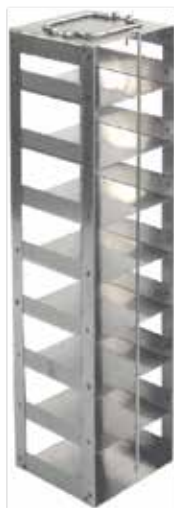
For 96-Deep Well Plates