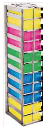
For 100 Cell Hinged Plastic Boxes