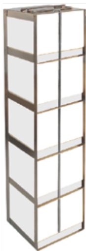
For 15mL & 50mL Centrifuge Tube Boxes