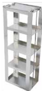
For Specialty Tube Racks