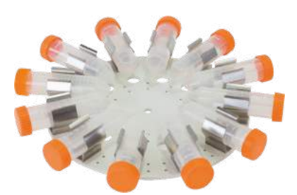
Carousel for 50mL Tubes TRA22