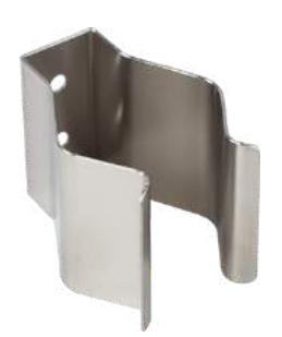
Tube Holders for 50mL Tubes TRA15