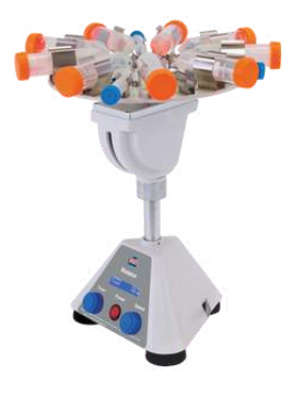
Digital Tube Rotator TR-04UA (180°)