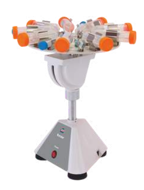
Standard Tube Rotator TR-03A (180°)