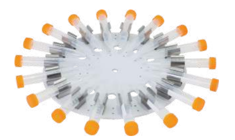
Carousel for 15mL Tubes TRA21