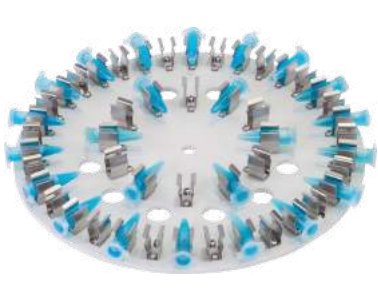
Carousel for 2mL Tubes TRA20