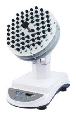
High Capacity Tube Rotator TR-05UA (45°)