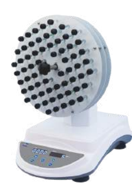
High Capacity Tube Rotator TR-05UA (95°)