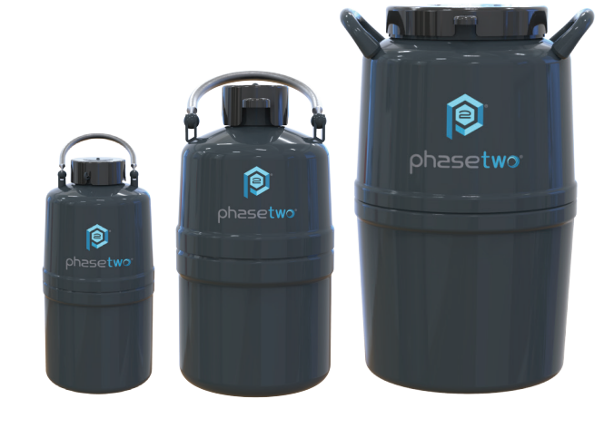
The VS Series Shippers are specifically designed to meet critical transportation needs.