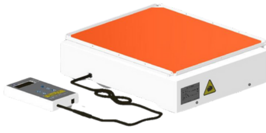
Orbital Shaker – CO2 Resistant OSC-26M