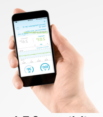
IoT Connectivity Protect your work

Point device to your account to begin controlling device