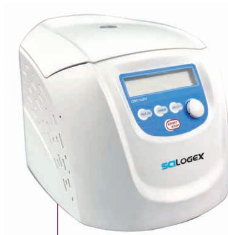
DM1424 Hematocrit Centrifuge