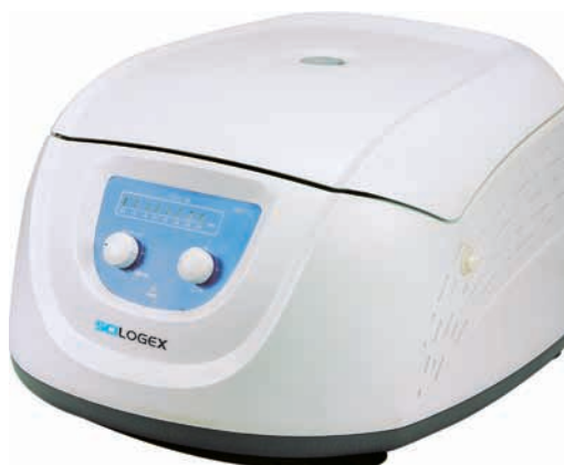
DM0412E Clinical Centrifuge