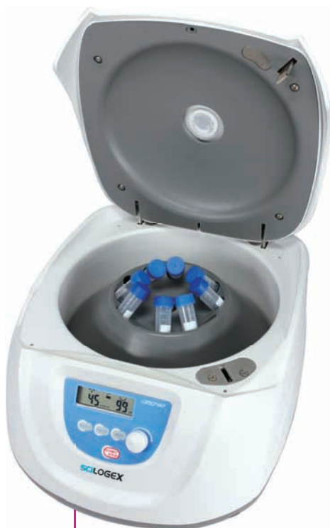
DM0412 Clinical Centrifuge