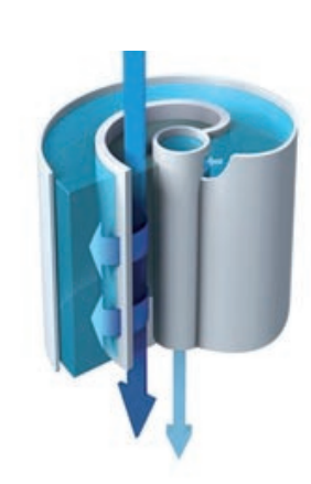
Figure 1. Flow-through view of a RiOs™ Essential system RO membrane, which is inserted into a cartridge. Tangential flow limits the risk of fouling; the membrane removes 95-99% of inorganics and 99% of all dissolved organic substances with greater than 200 Dalton, such as microorganisms and particles.