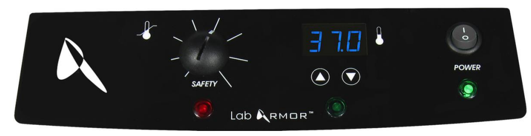
Figure 1. Control Panel

This section provides an overview of the panel controls. See Figure 1 for an illustration of the panel controls.