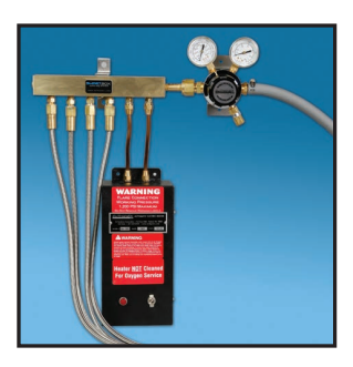
EA-6500 Heater Assembly

Allows for convenient cage loading and unloading of M1 Chamber.