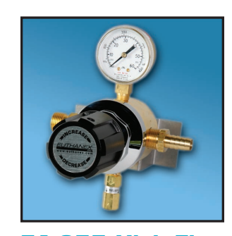
EA-255 High Flow Inline Regulator

O - 40 PSI For use with piped-in gas source.