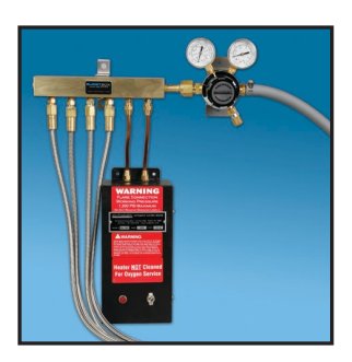
EA-6500 Heater Assembly

Allows for convenient cage loading and unloading of M1 Chamber.