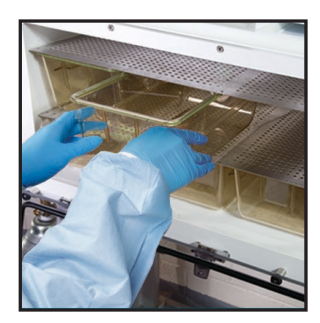
EA-5500 Stainless Steel Sliding Shelf

Enable stacking of cages without wire bar lids in the M1 chamber.