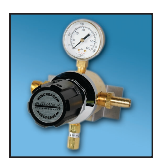
EA-255 High Flow Inline Regulator

0 - 40 PSI For use with piped-in gas source.