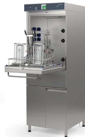
Getinge Lancer Ultima model 910 LX freestanding labware washer