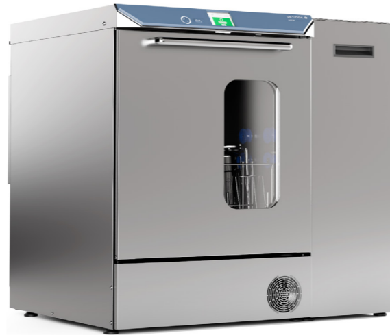
815 LX with side chemical cabinet (accessory)