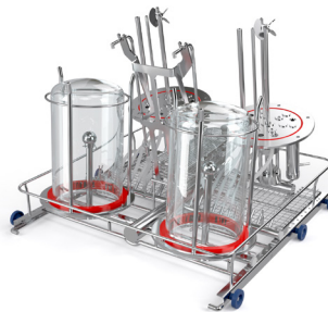
Getinge Applikon Bioreactors in place, multi-use, 0.26-0.79 gal (1-3 liter)