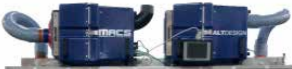
Part # – MACS-AHU-TOP