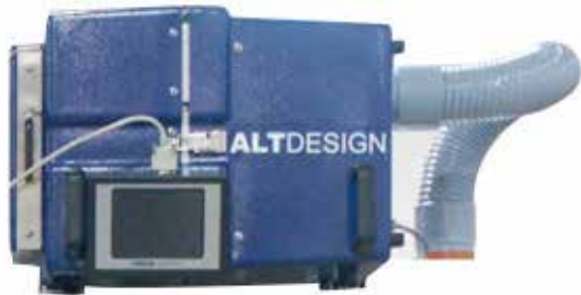
Part # – MACS-AHU-S-DE