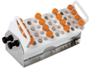
Adjustable Tube Rack