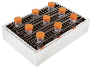
Mini Universal Spring Platform