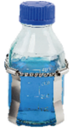
Infusion Bottle Clamp