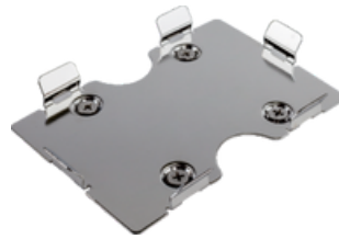
96-Well Micro-Plate Holder