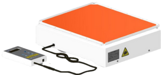
Orbital Shaker - CO2 Resistant OSC-26M