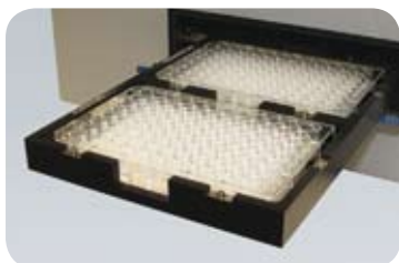
Dual microplate carrier with reagent plate and measurement plate

Unlike a conventional microplate reader, the NOVOstar has a dual microplate carrier that allows the user to designate one as a reagent plate and the other as a measurement plate. An integrated transfer pipettor delivers compounds from the reagent plate or from one of the three reagent stations to the measurement plate allowing the user to prepare wells or start kinetic events. Using this system, up to 384 compounds can be screened in a signalling assay - virtually impossible to do using a conventional plate reader. Additionally, two on-board reagent injectors can deliver variable volumes of reagent to wells giving you a wide range of liquid handling options, combined with the measurement abilities of a conventional multifunctional microplate reader.