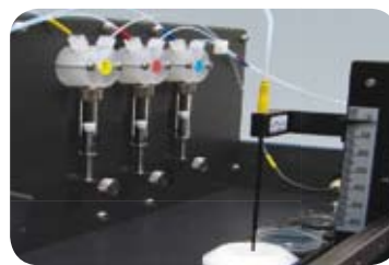
Advanced liquid handling with one pipettor, two reagent injectors, and three reagent stations

The NOVOstar is optimized to monitor fast kinetic events, such as calcium flux. These types of assays can easily be triggered using the transfer pipettor or one of the two built-in injectors. Reagent addition and measurements can be undertaken