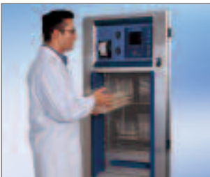
Racks and adjustable shelves