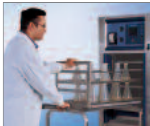
Load car and transfer carriage